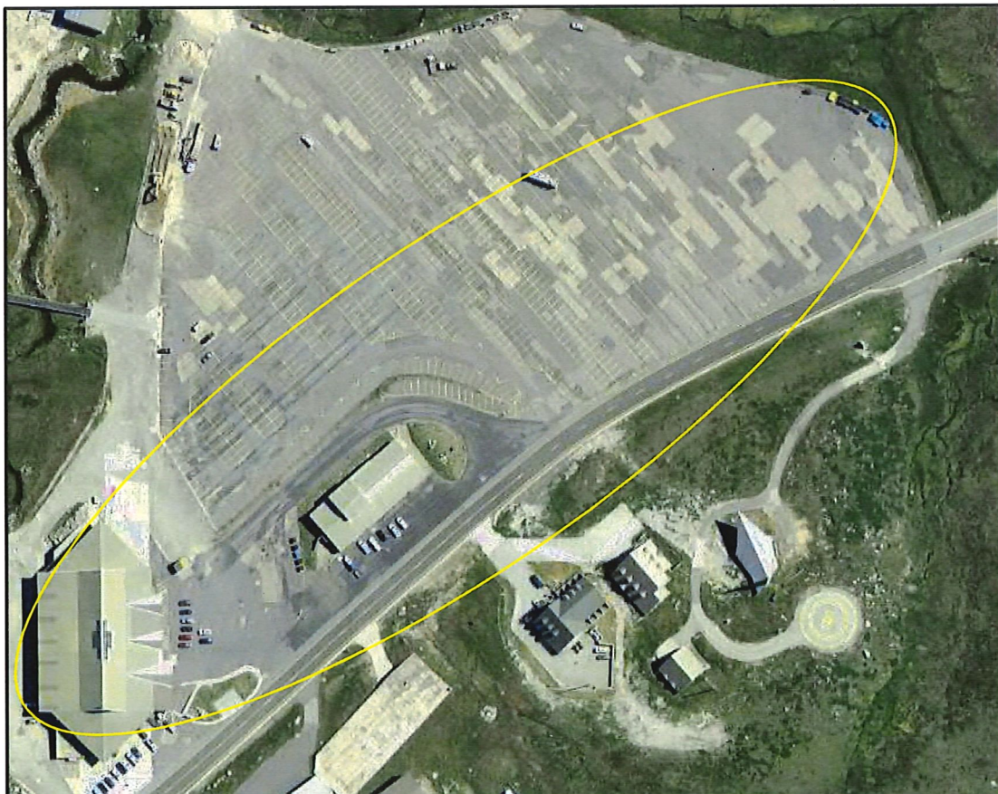
Figure 1: Site location

The site is located to the east of Perisher Creek, to the North of the Catholic Church and the emergency services buildings. The site is surrounded by ski slopes, resort infrastructure, native vegetation and tourist accommodation buildings.